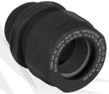
shown in black with standard seal